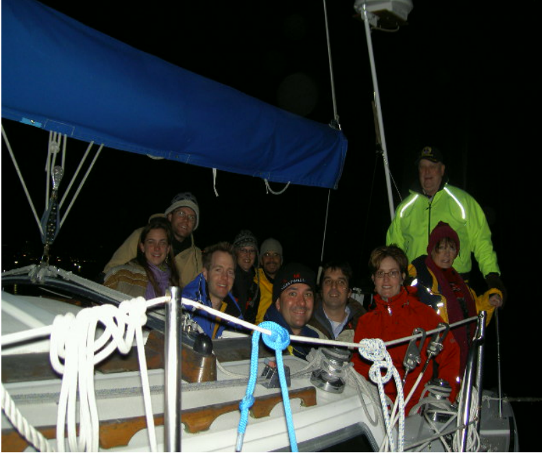
The happy crew from the "Chet Gibson Memorial Christmas Cruise" on Lake Washington (Kirkland).